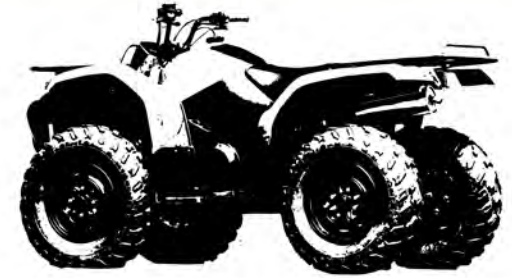
Utah Vicinity Map OHV Trail Systems