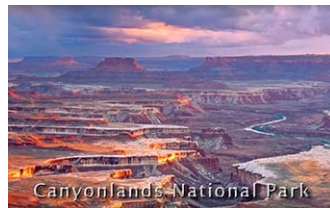
Canyonlands National Park