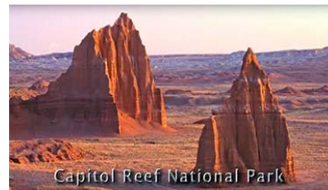
Capitol Reef National Park