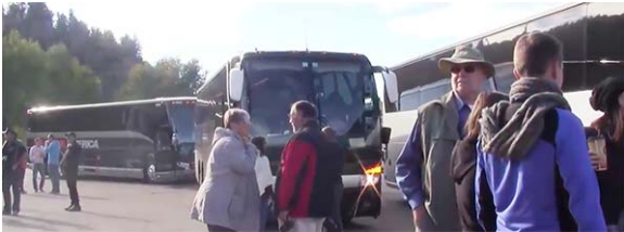
Visitors come from all over the world to experience Utah's national parks.

“There is nothing so American as our national parks.... The fundamental idea behind the parks... is that the country belongs to the people, that it is in process of making for the enrichment of the lives of all of us.”