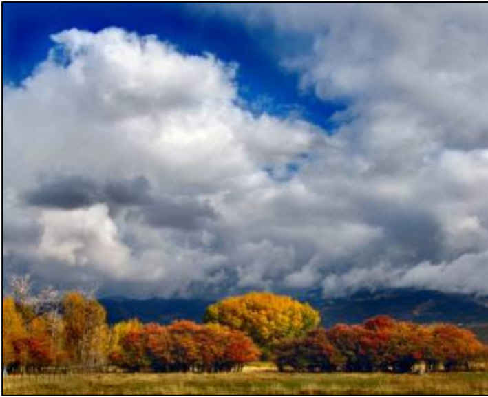
Fall Foliage, Spring City