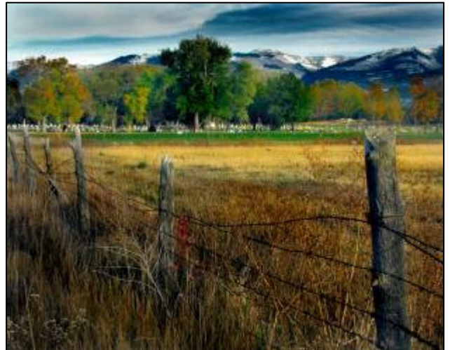
Spring City Cemetery