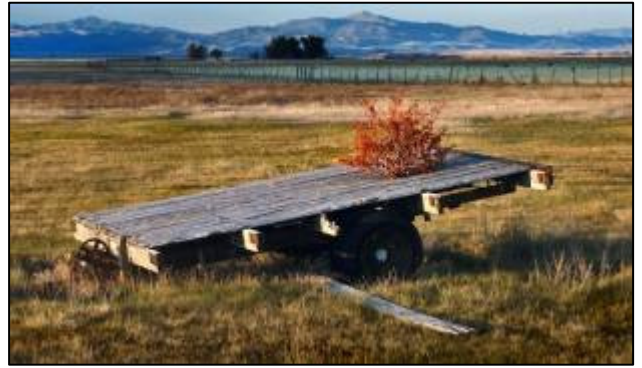
Old trailer, Sanpete Valley