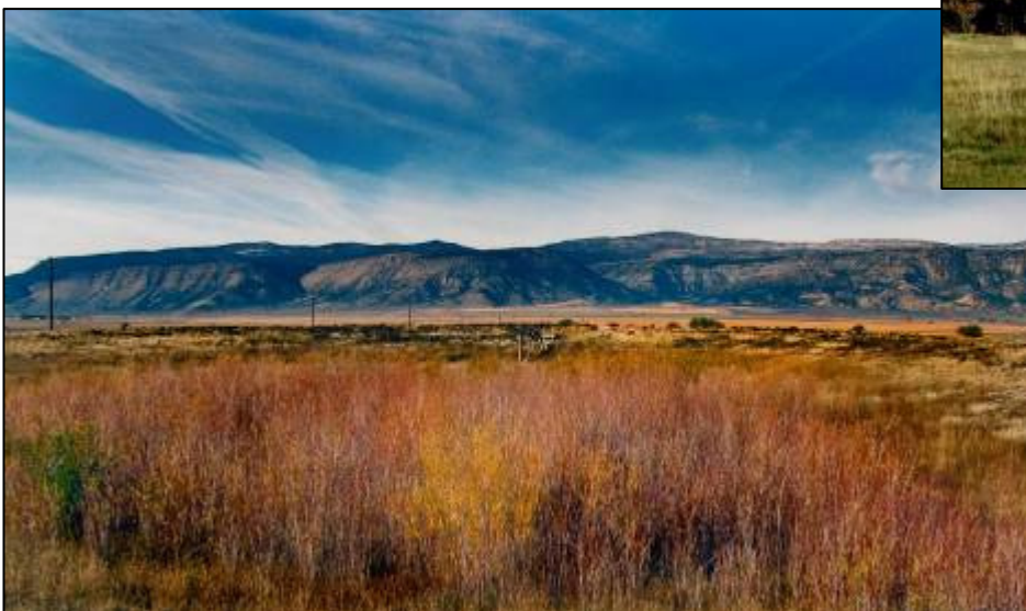
Reservoir and San Pitch Mountains