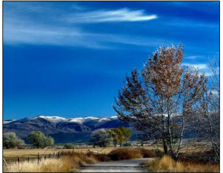
First Snow, Sanpete County