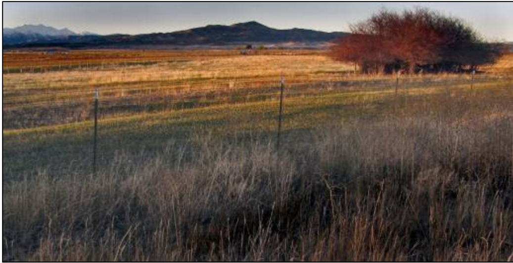
Fields near Spring City