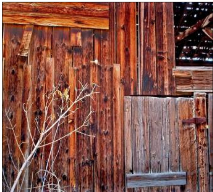
Barn in Fairview

For more information on the Sanpete County Travel and Heritage Council in Manti, call 435-835-6877 or 1-800-281-4346 or go to www.sanpete.com/pages/travel .