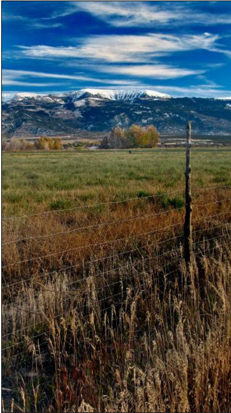
Fields below Horseshoe Mountain