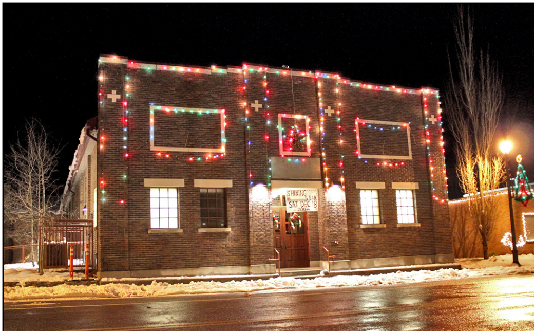
Roof replaced: Contractor Gunnison Valley Builders began restoration work on the dance hall a little over a year ago. They replaced the roof over the summer. They added an addition on the east side which doubled the hall's floor space. The building's electrical, plumbing and heating systems were also upgraded and the walls were strengthened to withstand a strong earthquake.