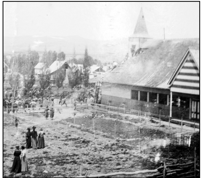
Eclipse Pavilion: The modern dance hall was erected around the dance floor from the wood Eclipse Pavilion, which was constructed in 1895. The pavilion was torn down because it was a fire hazard.

The brick building, which was built around the floor of an earlier wood-frame dance hall known as the Eclipse Pavilion, was completely overhauled. The electrical, plumbing and heating systems were modernized. The roof was replaced and the walls were seismically retrofitted. The floor was restored and the restrooms were refurbished.